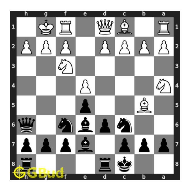
Figure 6: O-O-O - This is called queen side castling