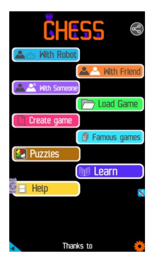
Figure 11: Play chess online for free. Solve puzzles and play with friends

Play chess for free at https://gbud.in/chs