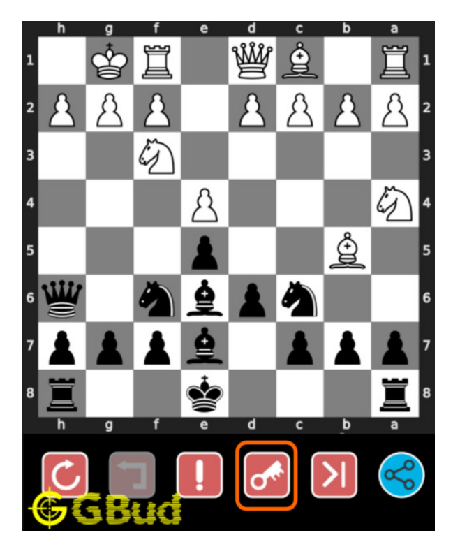
Figure 7: Click the solution button to view solutions @ https://gbud.in/gt24sc1