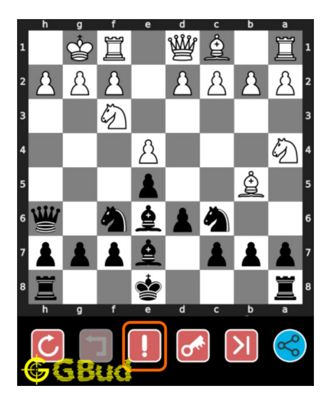
Figure 8: Click the help button to get help on next move @ https://gbud. in/gt24sc1

Access the latest version of this article at https://gbud.in/blog/game/chess/easy-chess-puzzles/easy-chess-puzzle-0032.html